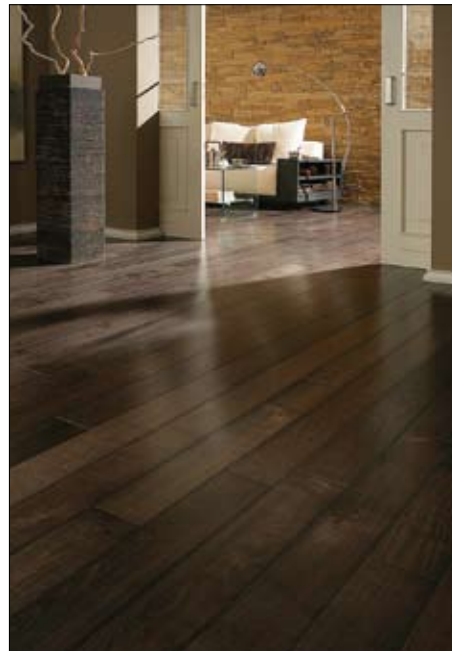
Emotion grade with Charcoal stain