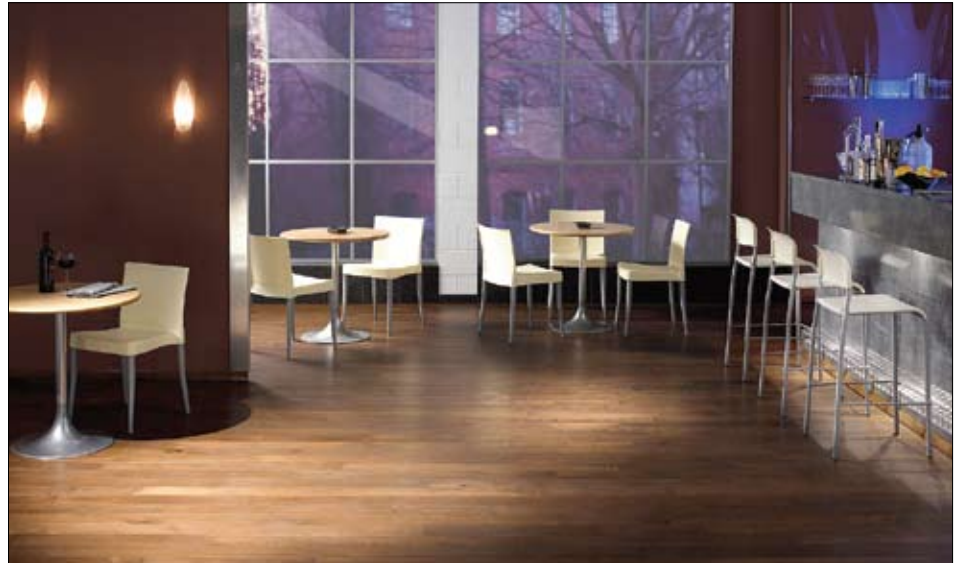
Pollmeier's hardwax oil finish with an Espresso stain