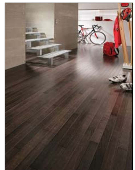
Elegance grade with a Charcoal stain

Pollmeier European beech flooring strips have a hardness rating of 1350 as measured by the Janka hardness test in conformance with ASTM