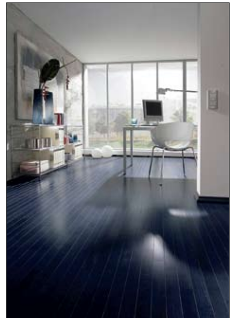
Pollmeier's sophisticated DesignLine with Ocean stain

Pollmeier European beech flooring is available with the following prefinish options for a clean, consistent look: