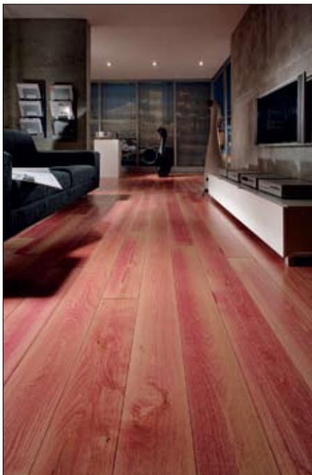
Pollmeier's stylish Magenta-Wash look