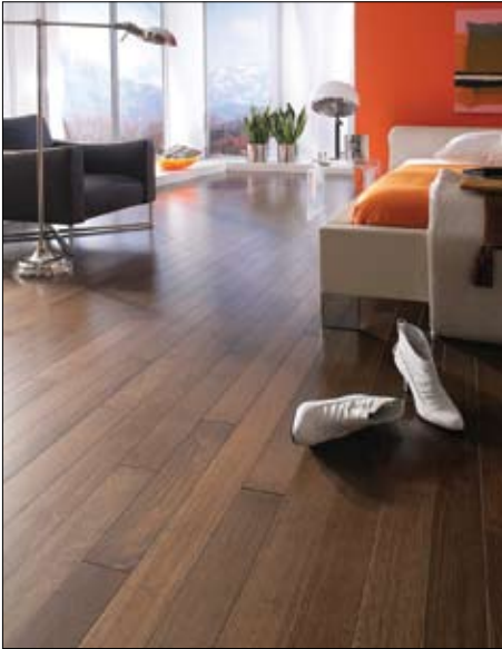
Elegance grade with Walnut stain