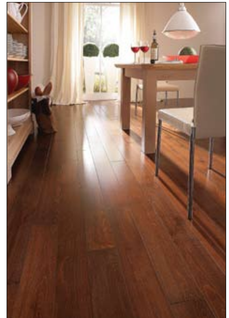
Emotion grade with Espresso stain