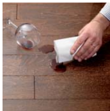
Stain resistant surfaces.