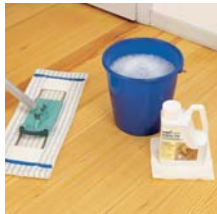
Naturally well maintained with Wash & Care ...