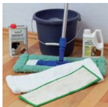
... and Liquid Wax Cleaner.

Whether in an office, restaurant, or exhibition hall – hardwax oil solid wood floors show their practical nature in business environments. The robust and resistant surfaces are less susceptible to being stained. Red wine, fruit juice and coffee spills do not leave stains even if not cleaned up promptly.